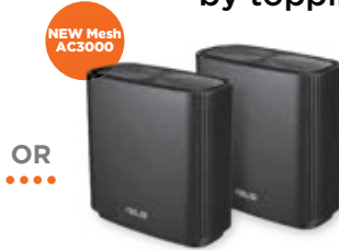
ASUS ZenWiFi AC (Pack of 2 worth $499) $10/mth