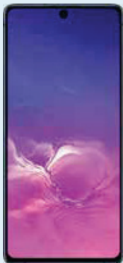
Samsung Galaxy S10 Lite

mySIM ® 40 | EM3+ $36.00/mth | $34.70/mth