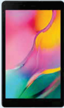
Samsung Galaxy Tab A 8.0

Please remember to bring your NRIC and Staff Pass to qualify for CORI promos