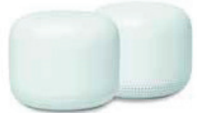
Google Nest Wifi (Router and point worth $428) $15/mth Built-in Google Assistant