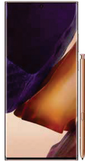
Samsung Galaxy Note20 Ultra 5G