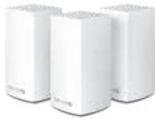
Linksys Velop (Pack of 3 worth $399) $10/mth