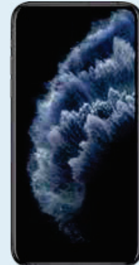
iPhone 11 Pro Max 64GB

mySIM ® 40 | EM3+ $36.00/mth | $34.70/mth