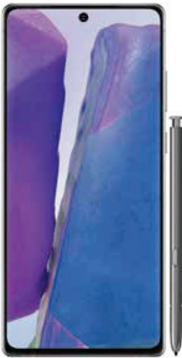
Samsung Galaxy Note20

Please remember to bring your NRIC and Staff Pass to qualify for CORI promos