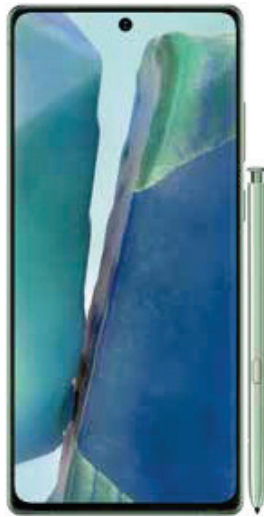
Samsung Galaxy Note20 5G