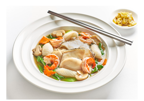
Terms & Conditions: Prices are subject to 10% service charge and prevailing government taxes. Not valid for takeaway/delivery, set menus, buffets, wine and liquor sold by the bottle, or with other promotions, discounts and vouchers, unless otherwise stated. Not valid for events and catering services. Not valid on eve of and on public holidays as well as on special occasions and promotional periods, unless otherwise stated. *Not valid for orders of appetisers, soups and starters.