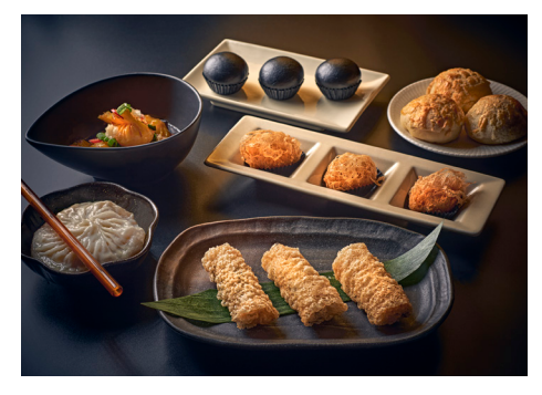
20% off à la carte food & beverage menu at Coffee Lounge, L'Espresso, Gordon Grill, Min Jiang and Min Jiang at Dempsey

Please present your MOE staff pass to enjoy: