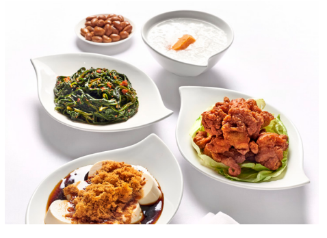
$3<sup>++</sup> free flow of soft drinks per person with every order of à la carte main course, Taiwan Porridge or Local Degustation menu at Coffee Lounge *