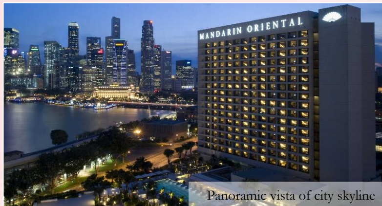
Panoramic vista of city skyline