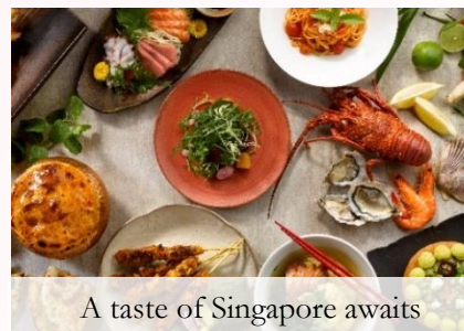
A taste of Singapore awaits

For bookings , please email wanyit@mohg.com or Whatsapp 98507664