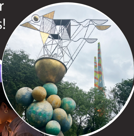
Ng Eng Teng, The Explorer, 1999. Collection of Singapore Art Museum.

Where is Ng Eng Teng's iconic sculpture 'The Explorer' located at the Science Centre? Find out with an al fresco buffet dinner with our guest scientists!