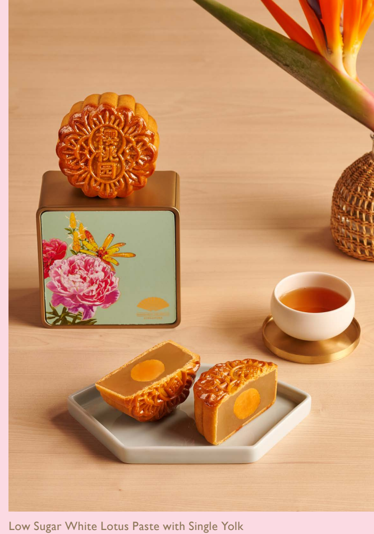
Low Sugar White Lotus Paste with Single Yoll 低糖单黄白莲蓉月饼