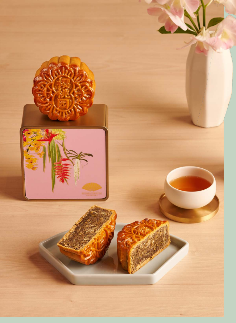
Chestnut with Exceptionally Singapore Tea and Almond 非凡新加坡茶香杏仁月饼